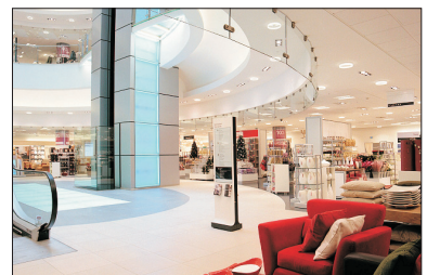
Debenhams Bullring, Birmingham