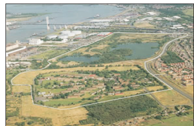
ProLogis Park, Dartford