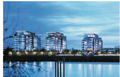
Wandsworth Riverside Quarter, London

Project Office Everything you need to manage complex, multi-faceted development or asset management programmes within a single integrated solution.