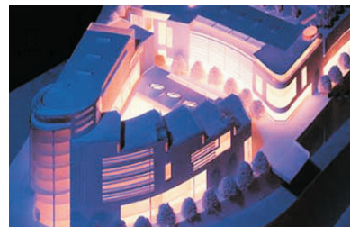
Greenside Place, Edinburgh