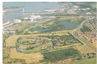
ProLogis Park, Dartford