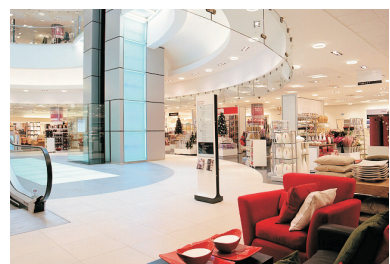
Debenhams Bullring, Birmingham